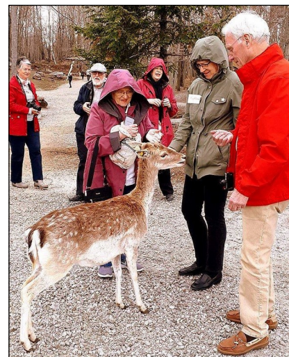
Greater Des Moines in Parc Omega