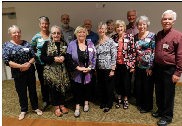
FF Ottawa visit FF Oklahoma & St Louis MI