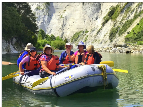
FFO ambassadors rafting in New Zealand