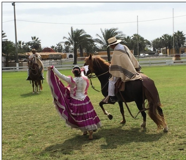
2 Marinera dancers perform in Peru