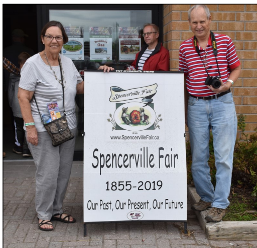
FF Big Canoe, GA inbound visits local fair