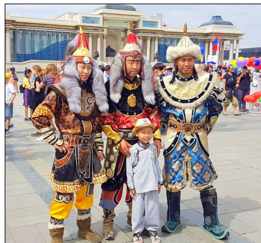
FFO saw these well-dressed men in Mongolia