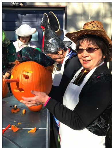
FF Taipei, Taiwan at Halloween