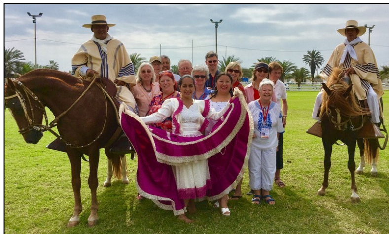
FFO outbound journey to Peru, 2019.

FFO enjoys an enviable reputation at FFI and among FF clubs as a progressive club that gets things done right and our goal is to keep it that way. The Board welcomes your suggestions and comments at any time. I look forward with pleasure to continuing as your president for the upcoming year.